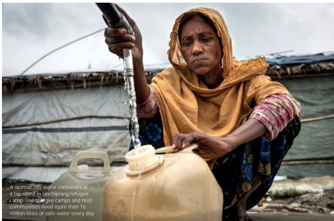
A woman fills water containers at a tap-stand in Unchiprang refugee camp. The refugee camps and host communities need more than 16 million litres of safe water every day.

The vast majority of Rohingya rely on water drawn from handpumps fitted to tubewells.