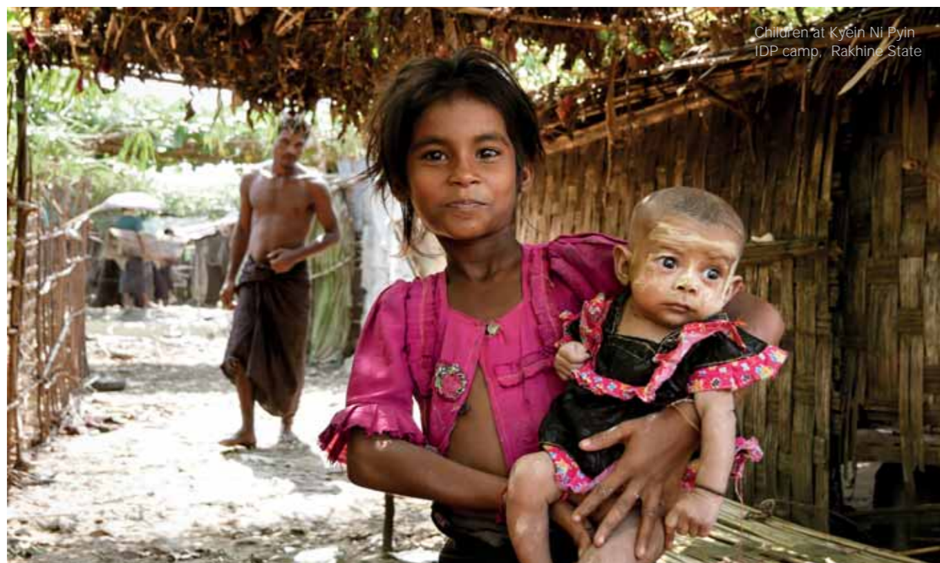
Children at Kyein Ni Pyin IDP camp, Rakhine State