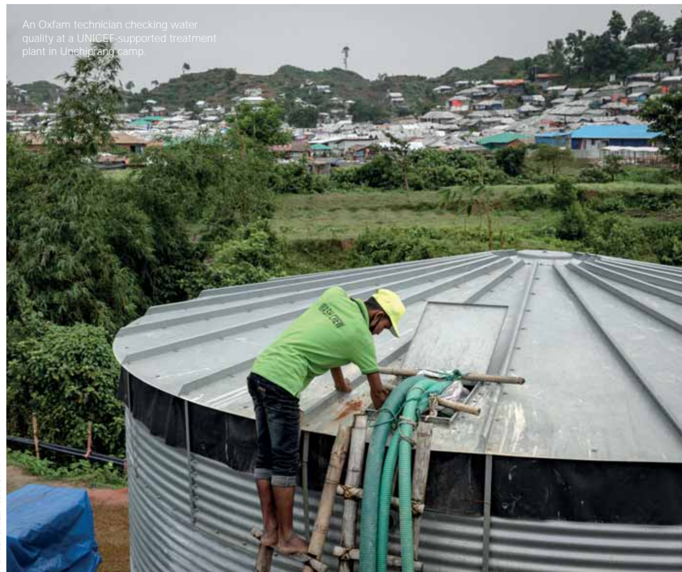
An Oxfam technician checking water quality at a UNICEF-supported treatment plant in Unchiprang camp.