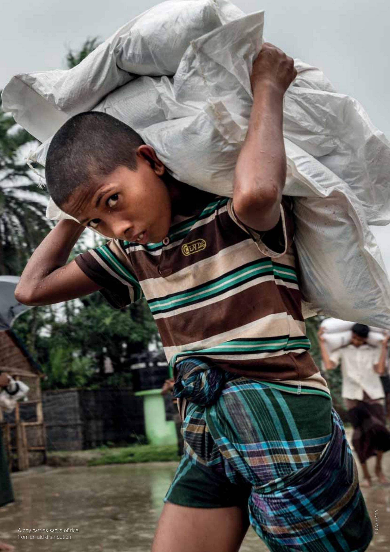
A boy carries sacks of rice from an aid distribution