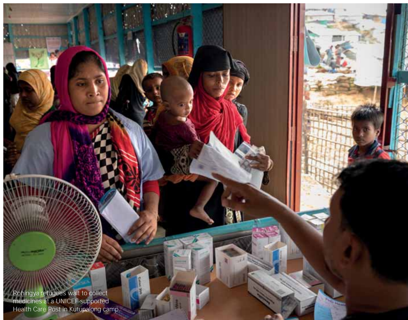
Rohingya refugees wait to collect medicines at a UNICEF-supported Health Care Post in Kutupalong camp.