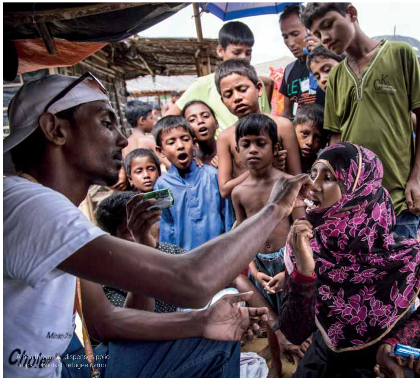
A health worker dispenses polio drops in Balukali refugee camp.