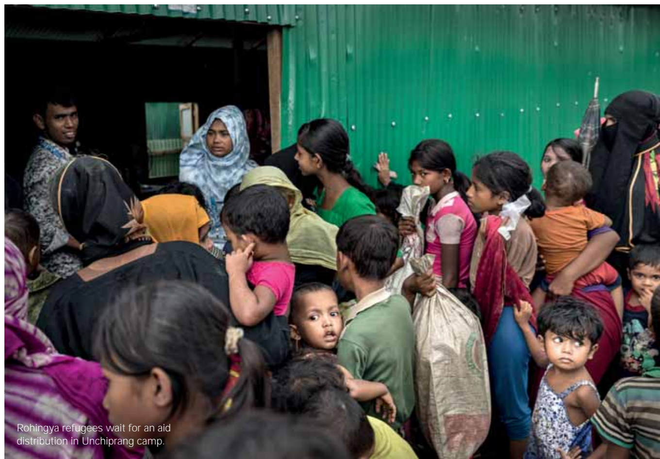
Rohingya refugees wait for an aid distribution in Unchiprang camp.