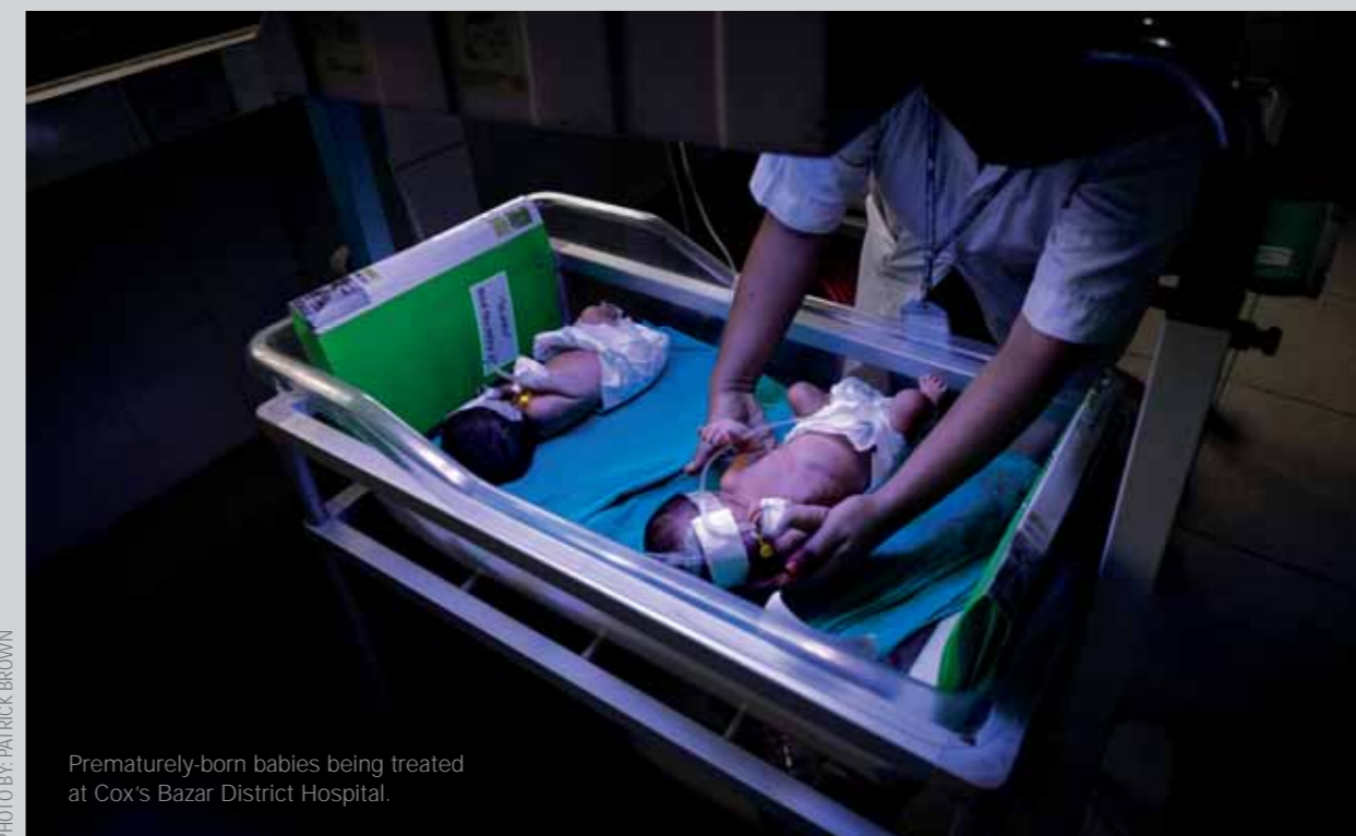
Prematurely-born babies being treated at Cox’s Bazar District Hospital.