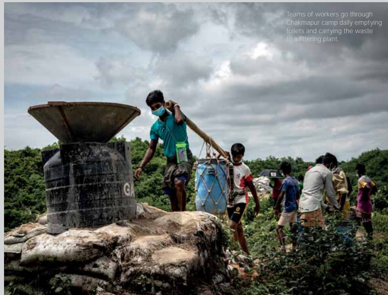
Teams of workers go through Chakmapur camp daily emptying toilets and carrying the waste to a filtering plant.