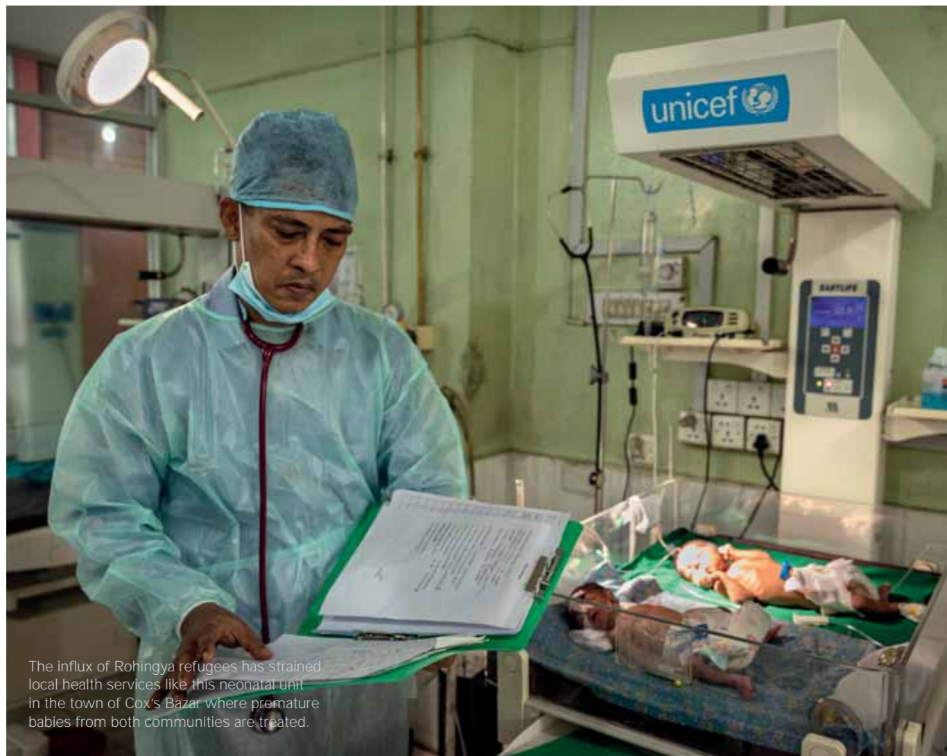
The influx of Rohingya refugees has strained local health services like this neonatal unit in the town of Cox's Bazar where premature babies from both communities are treated.