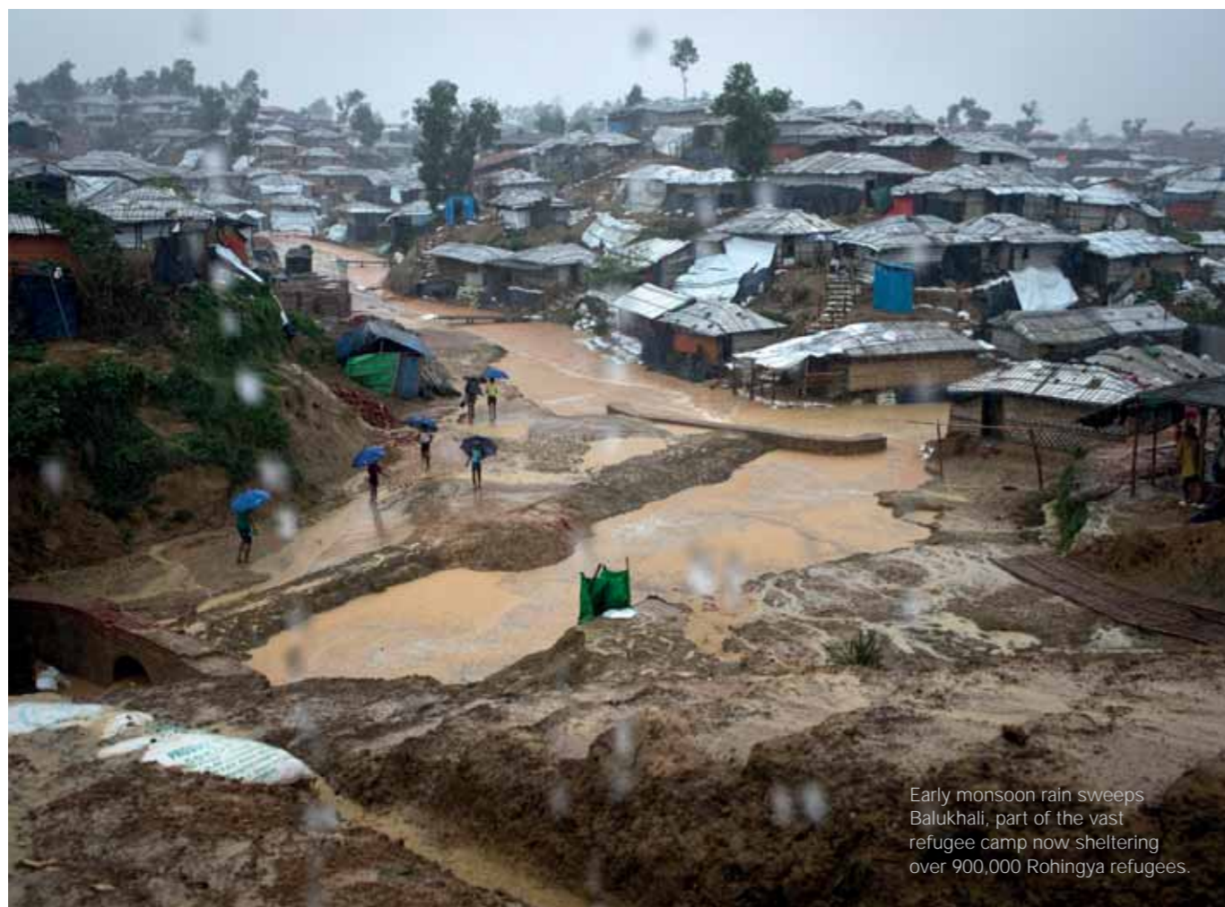
Early monsoon rain sweeps Balukhali, part of the vast refugee camp now sheltering over 900,000 Rohingya refugees.

"We won't go, we will stay here," says Dulu firmly. "If we are going to die (in Bangladesh), we will die in this place," she adds.