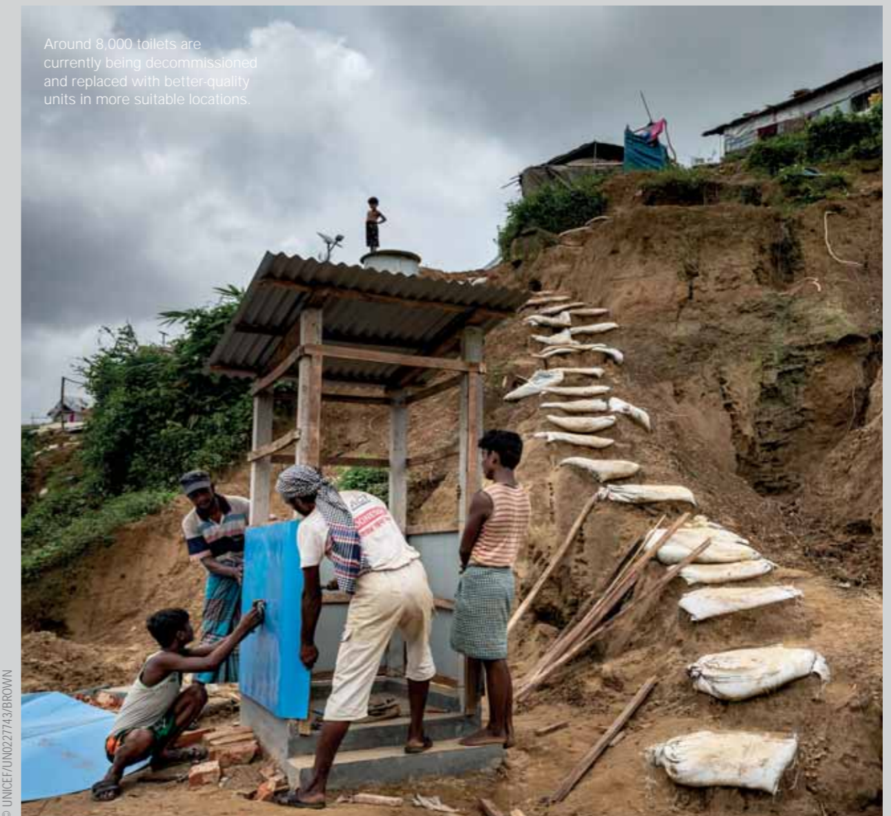
Around 8,000 toilets are currently being decommissioned and replaced with better-quality units in more suitable locations.