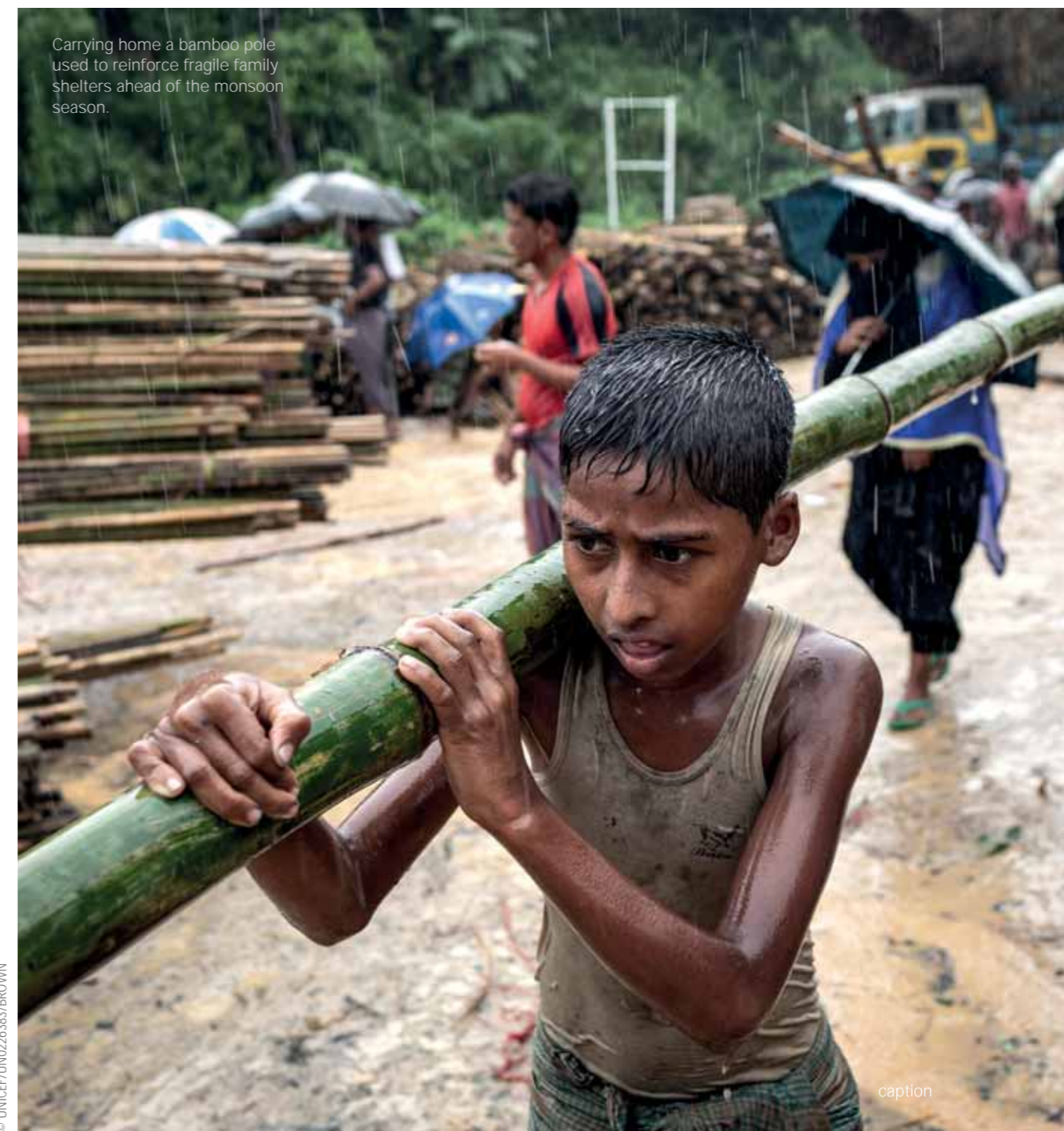
Carrying home a bamboo pole used to reinforce fragile family shelters ahead of the monsoon season.

Twelve months on, providing psychosocial support to children still struggling with the mental consequences of the horror they went through in Myanmar remains as vital as ever. At the same time, other protection concerns have grown.