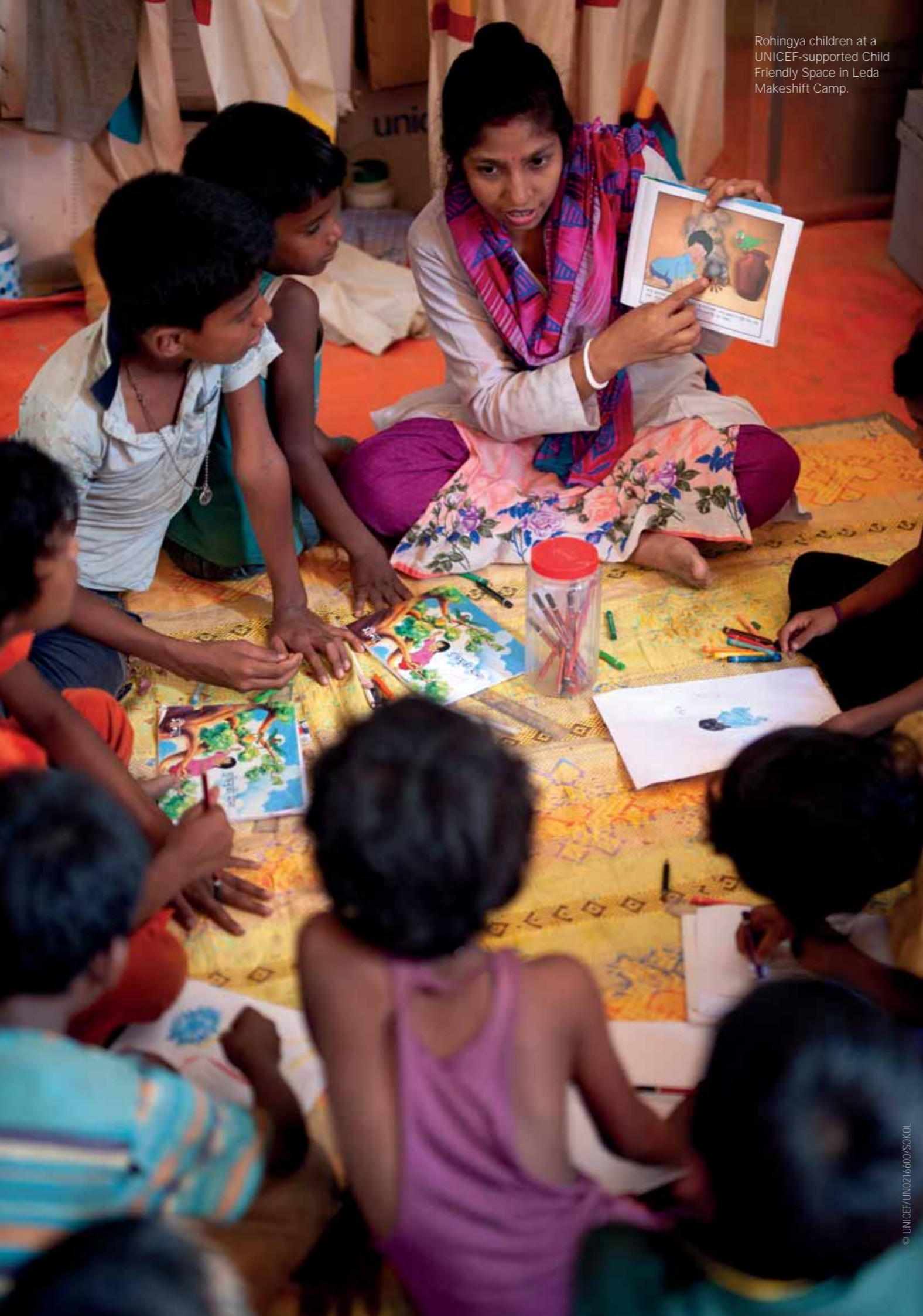
Rohingya children at a UNICEF-supported Child Friendly Space in Leda Makeshift Camp.